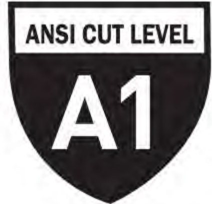
New PIP Shield Icon