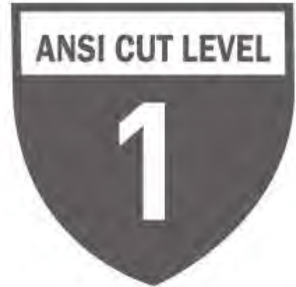
Old PIP Shield Icon

The new ANSI standard now features nine cut levels significantly reducing the gaps between each level and better defining protection levels for the cut resistant gloves and sleeves with the highest gram scores. The graph on the next slide shows the differences between the old scale and the new scale. New ANSI cut scores will feature an “A” in front of the score.